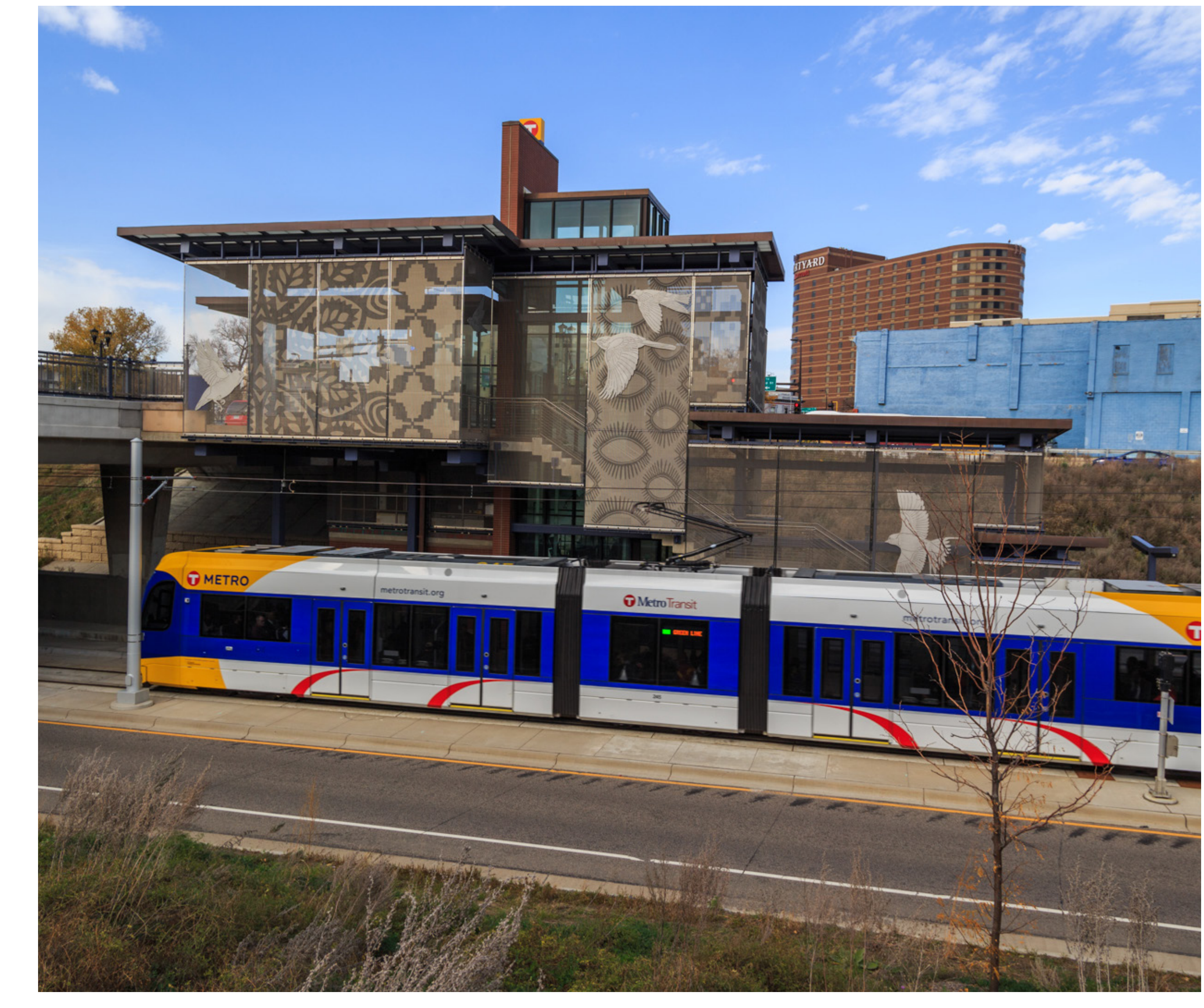
West Bank Station, METRO Green Line