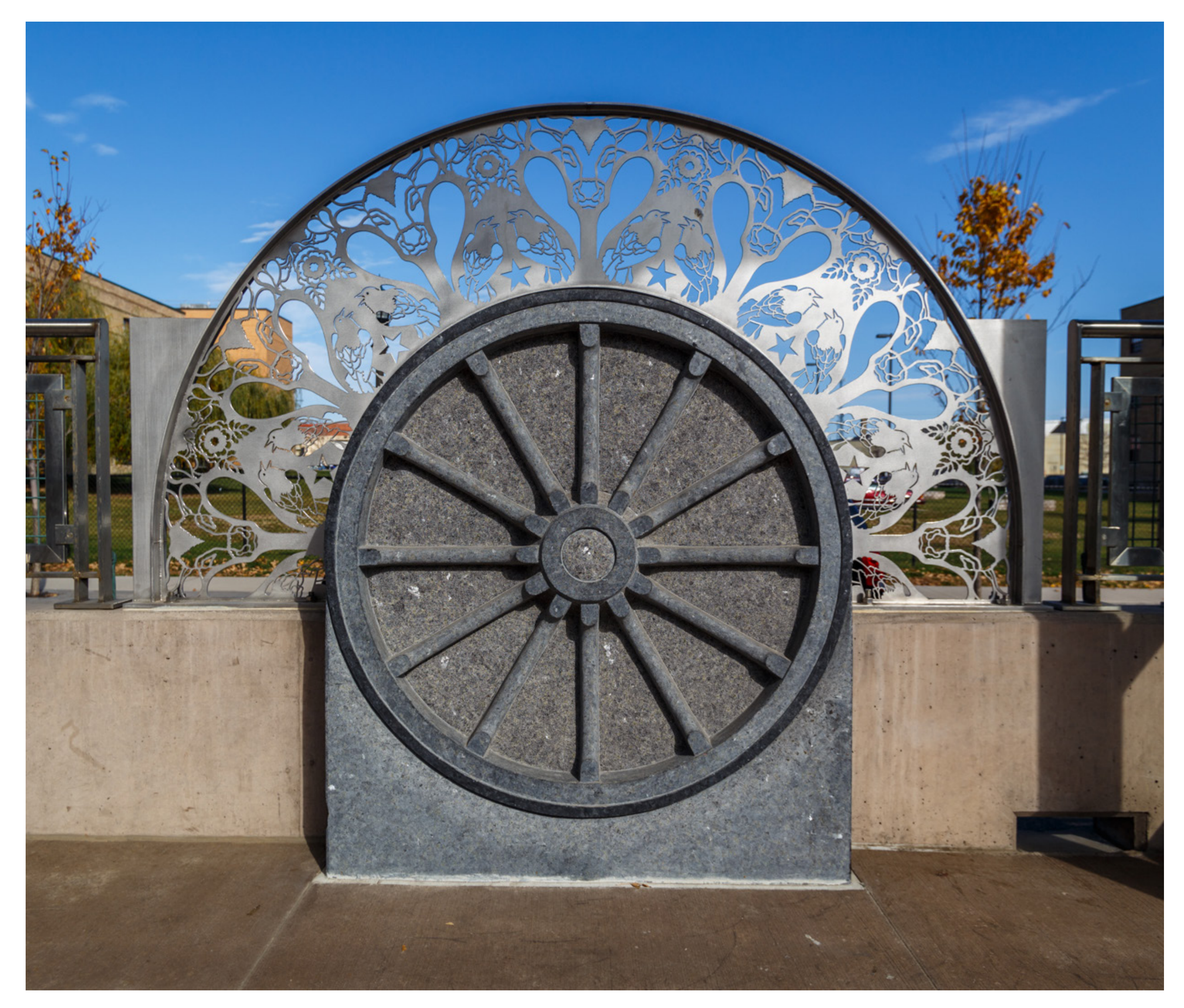
Raymond Avenue Station, METRO Green Line