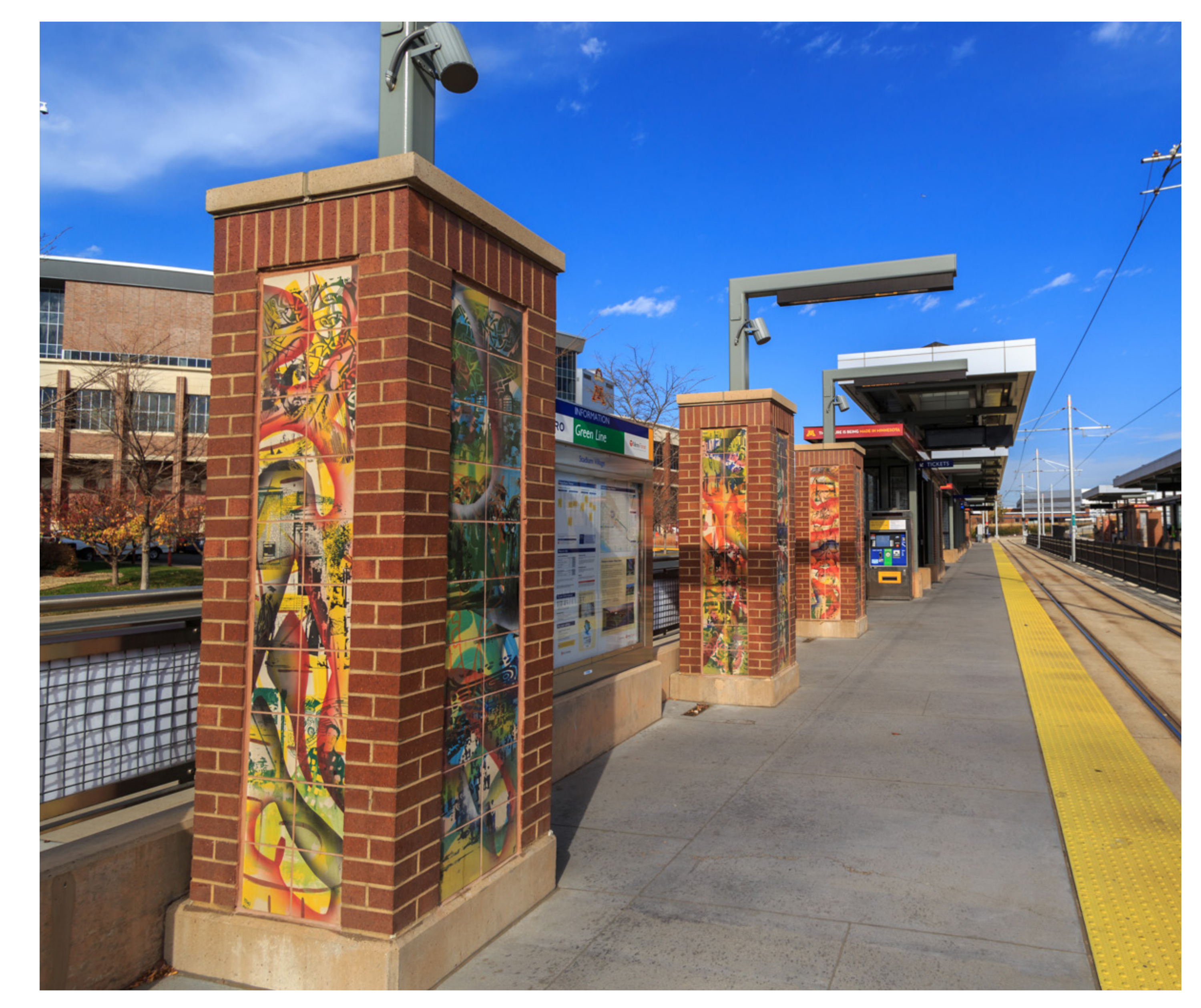
Stadium Village Station, METRO Green Line