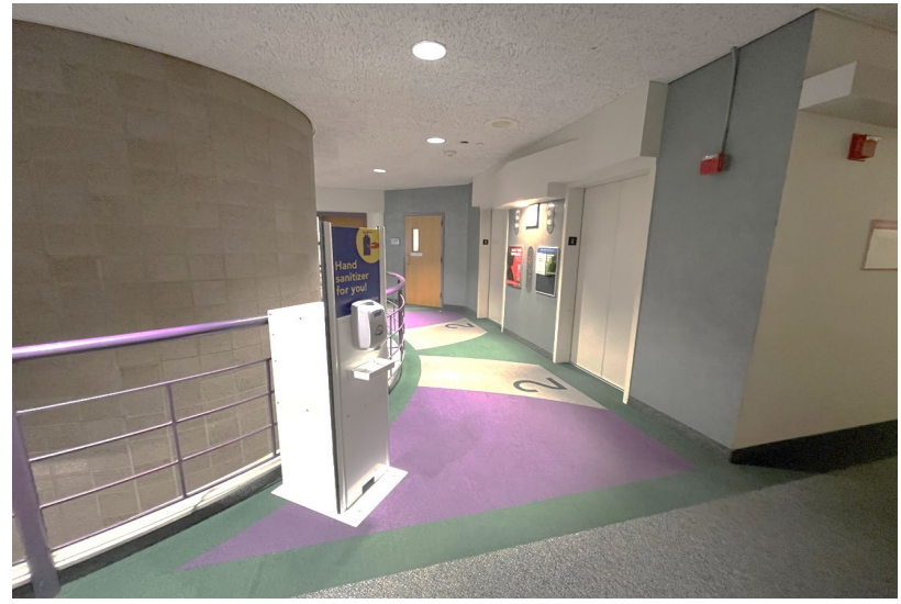
Existing Lobby Design