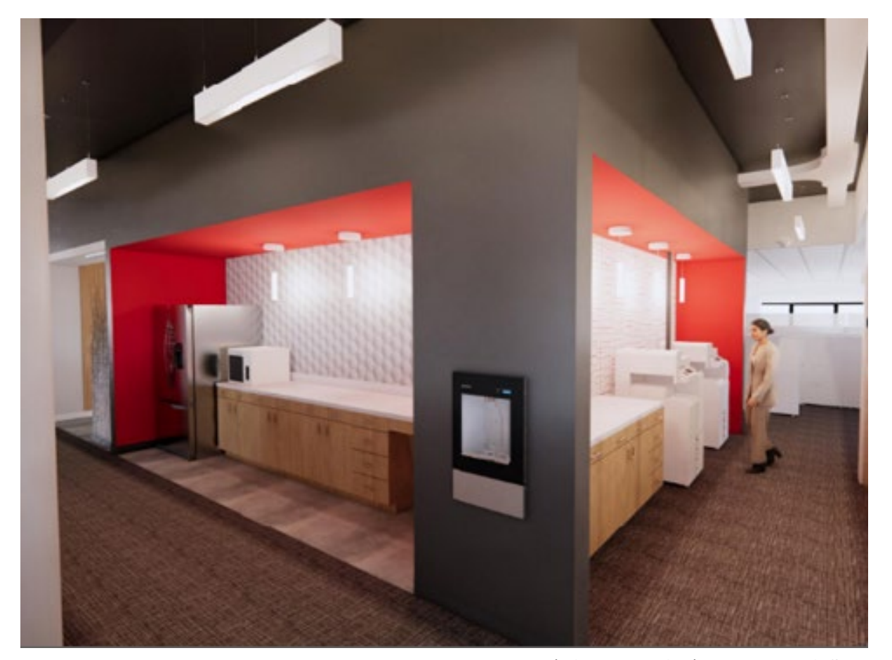
Kitchenette and Print area on each floor