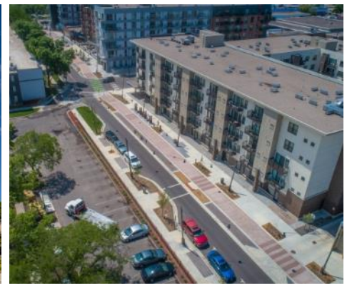
The ARTery, Hopkins