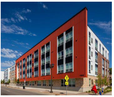
Hamline Station, St. Paul