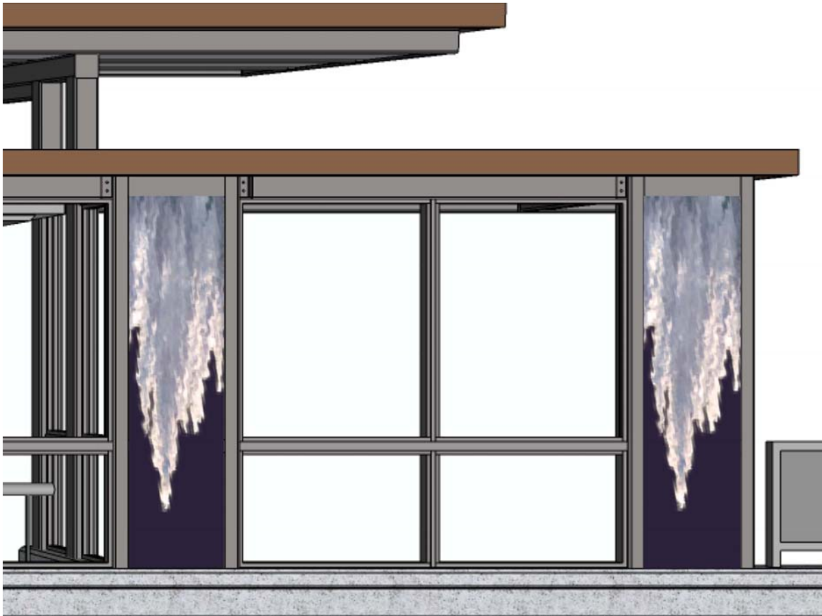
Infill panels featuring frozen water glass and stone mosaics