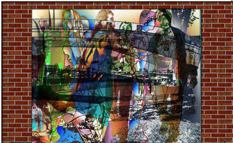
Brick and tile large panel