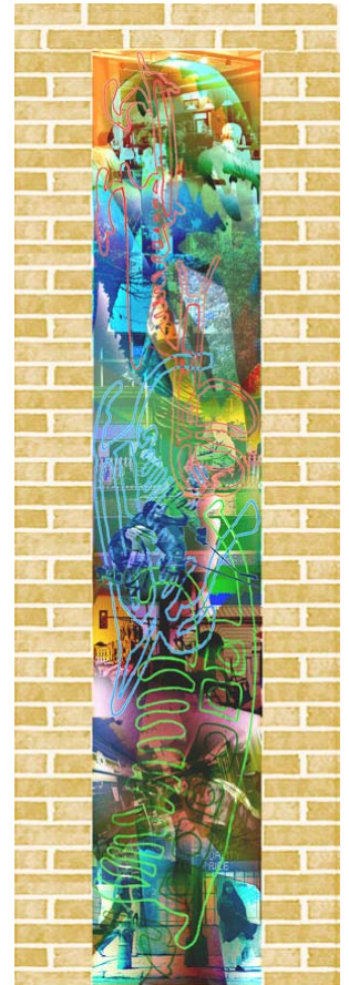
Brick and tile column

About the project: The Central Corridor Light Rail Transit Project will link downtown St. Paul and downtown Minneapolis along Washington and University avenues via the State Capitol and the University of Minnesota. Construction would begin in 2010 on the planned 11-mile Central Corridor line, with service beginning in 2014. The line would connect with the Hiawatha LRT line at the Metrodome station in Minneapolis and the Northstar commuter rail line, which will begin operation in late 2009, at the new Minneapolis Multimodal Station. The Metropolitan Council will be the grantee of federal funds. The regional government agency is charged with building the line in partnership with the Minnesota Department of Transportation. The Central Corridor Management Committee, which includes the mayors of St. Paul and Minneapolis, the University of Minnesota and commissioners from Ramsey and Hennepin counties, provides advice and oversight. The Central Corridor LRT Project Website is www.centralcorridor.org .