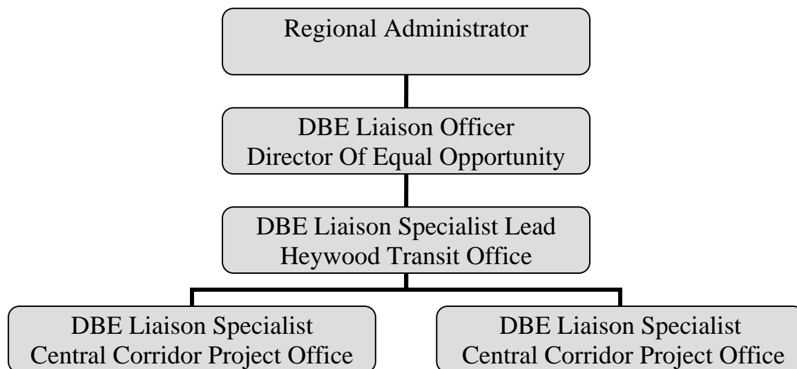
Figure 1: DBE Organizational Chart

The DBE Liaison Officer is responsible for developing, coordinating, and monitoring the implementation of the Council's DBE program on a day-to-day basis. Implementation of the DBE program has the same priority as compliance with all other legal obligations incurred by the Council in its financial assistance agreements with USDOT.