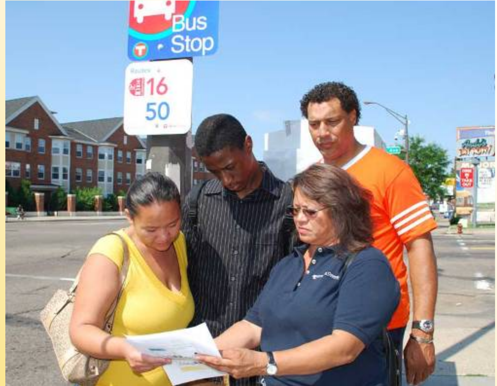
Talking to transit users