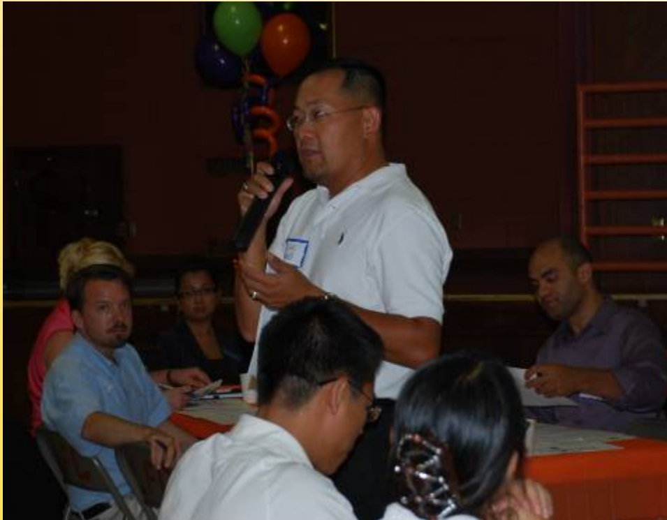
Hmong workforce meeting