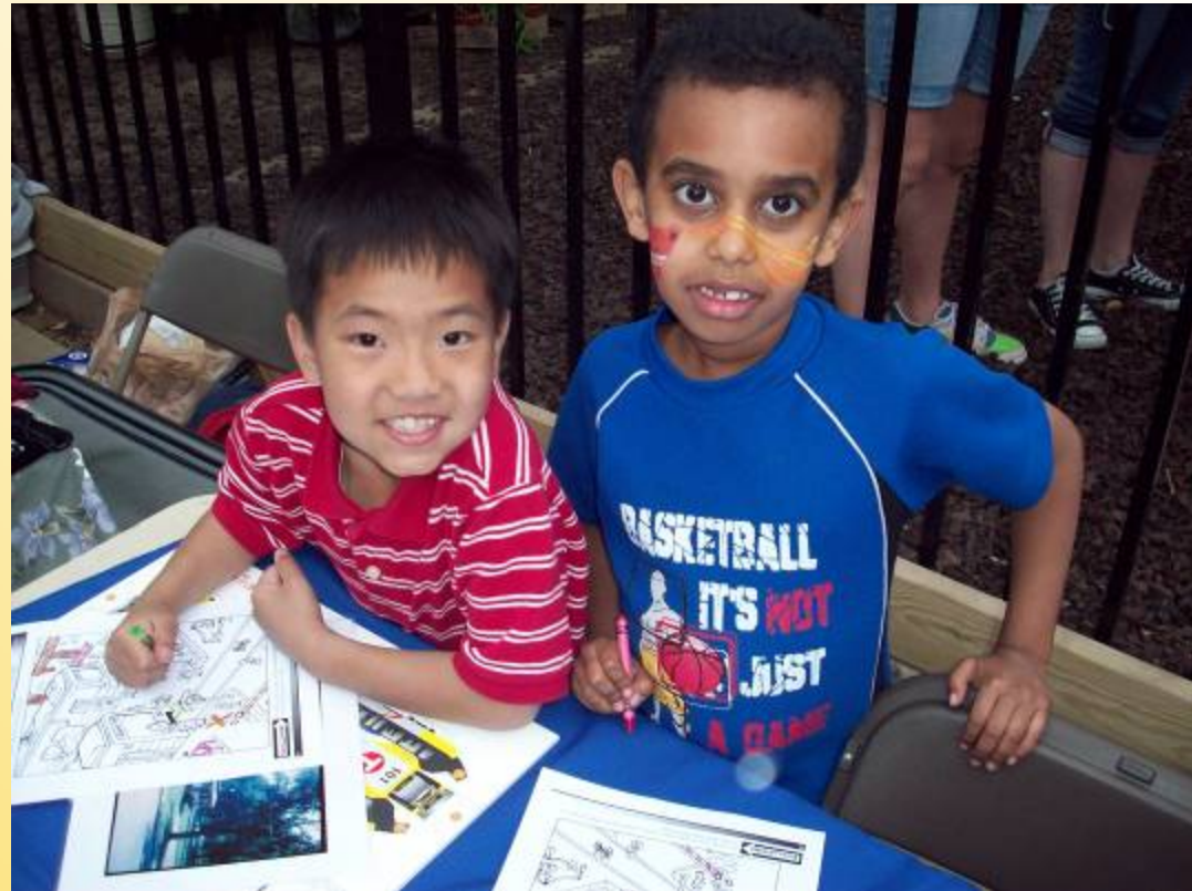
Pratt School Ice Cream Social