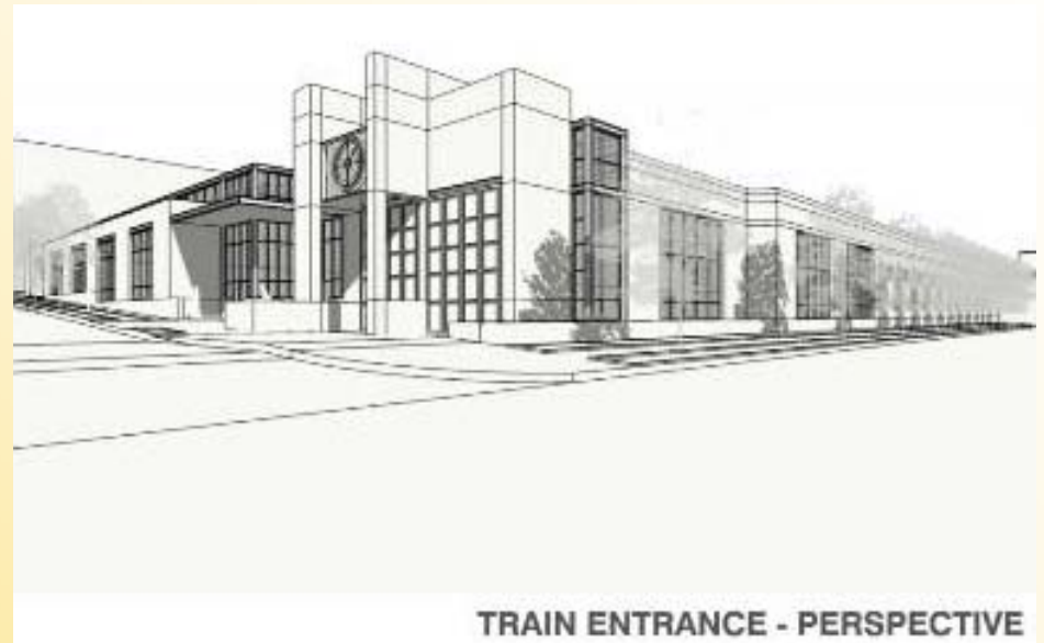
TRAIN ENTRANCE - PERSPECTIVE