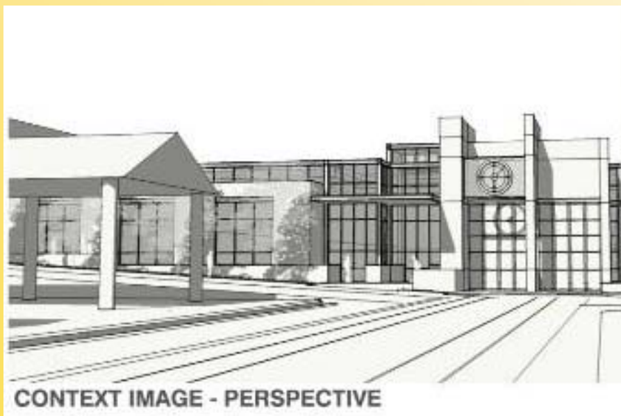
CONTEXT IMAGE - PERSPECTIVE