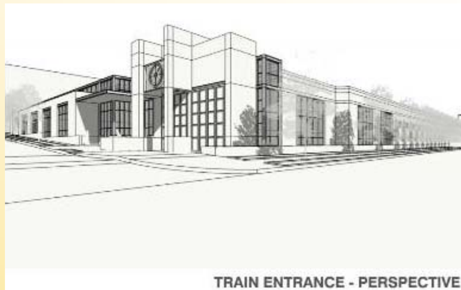
TRAIN ENTRANCE - PERSPECTIVE