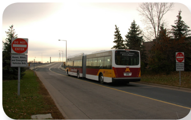
Figure 2-6: BRT - U of M Campus Connector on Transitway

line, already operating between downtown Minneapolis and the Mall of America, has been extended to meet the Northstar Commuter Rail line at the Target Field Station and will need to shift from two- to three-car trains to expand its capacity. Also two Bus Rapid Transit (BRT) lines are under construction on highways south of downtown Minneapolis: