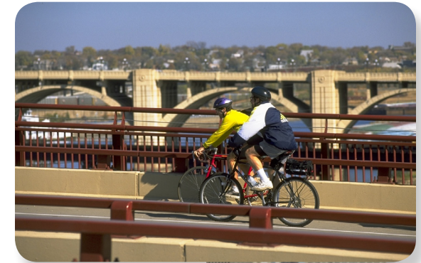
Figure 2-7: Bike commuting is a growing mode choice in the region

The region is able to draw on proven as well as innovative tools to achieve a transportation system that best meets current and future needs. No single solution will accomplish that goal, but taken together, coordinated and refined, they will keep the region moving and vital.