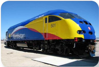
Figure 2-5: Northstar Commuter Rail