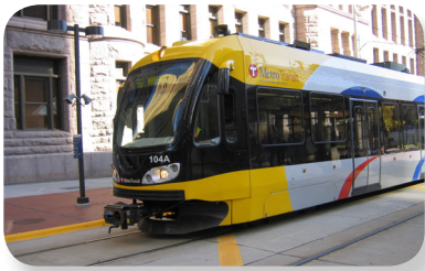
Figure 2-3: Hiawatha LRT