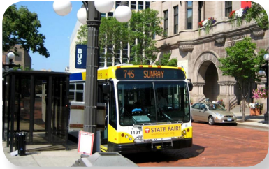
Figure 2-4: Metro Transit Bus