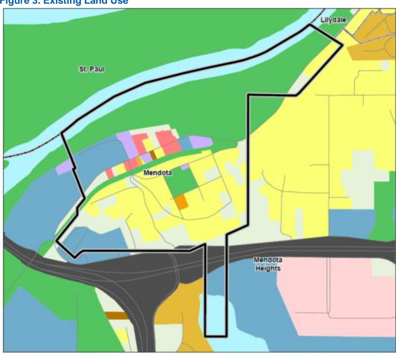
Figure 3. Existing Land Use