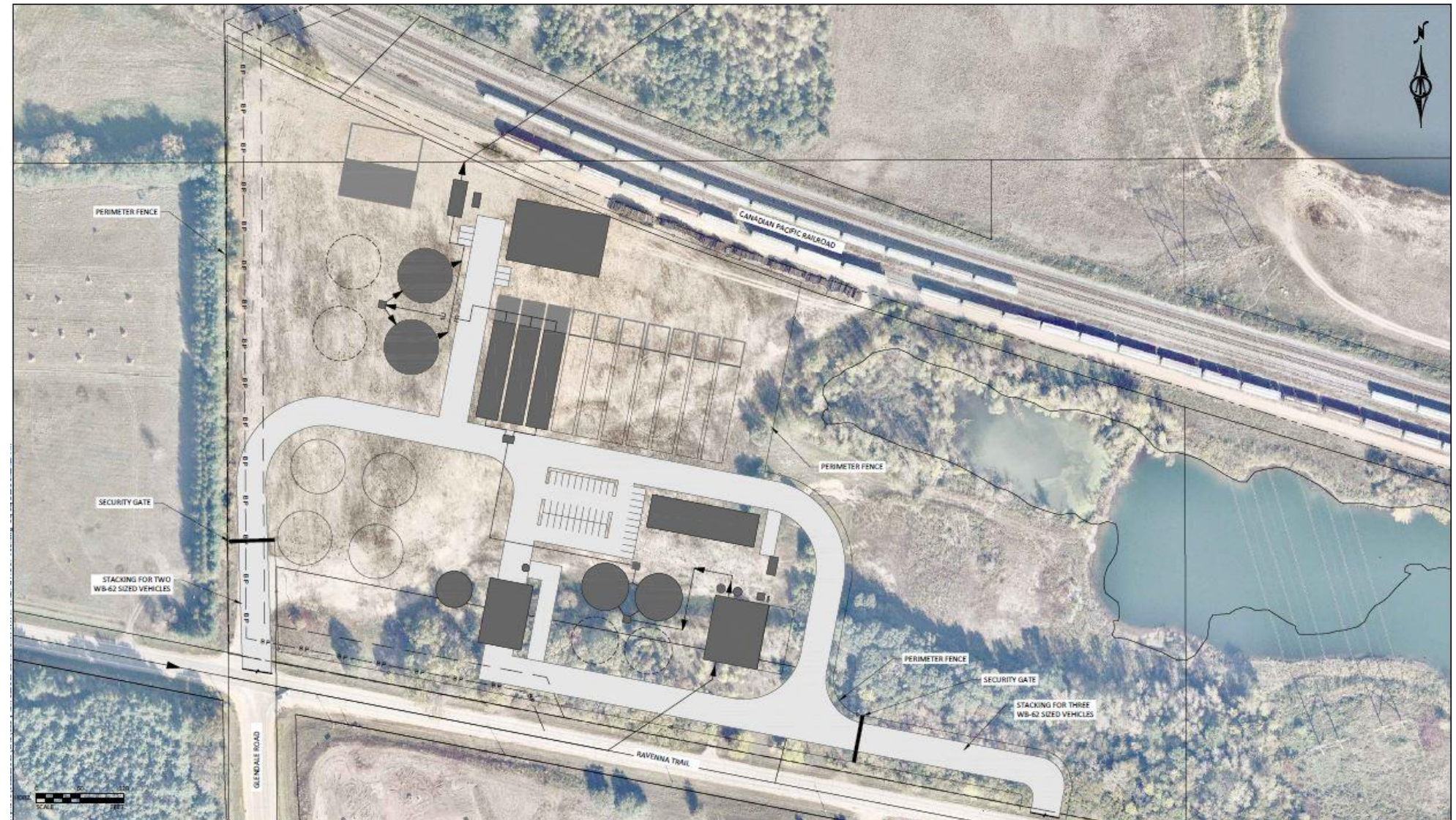
Concept Layout for New Plant at 2445 Ravenna Trail, Hastings MN 55033