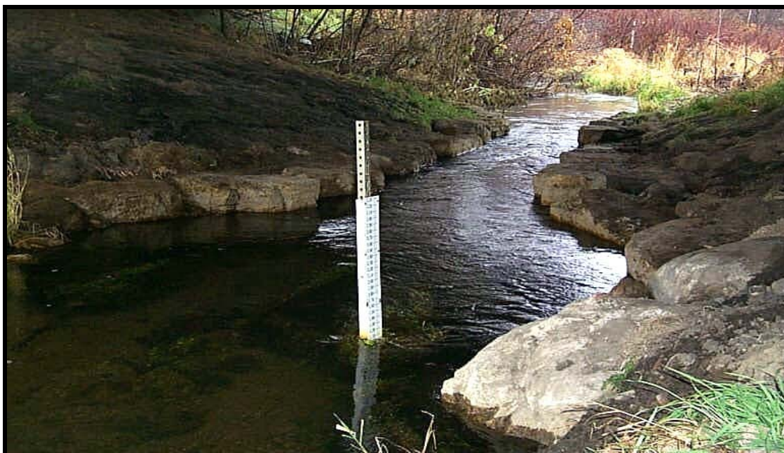
Table 1.EA. Eagle Creek Monitoring Station Information

Station Address: 8451 West 126th Street, Savage, MN 55378 County: Scott Major Basin: Minnesota River Basin Watershed: Sub-watershed of the Lower Minnesota River Watershed Drainage Area: 3.4 square miles