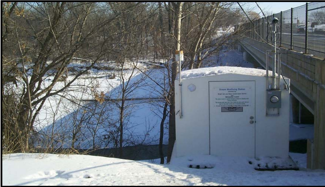
Table 1.CW. Crow River (Rockford) Monitoring Station Information

Station Address: 8200 State Highway 55, Rockford, MN County: Wright Major Basin: Mississippi River Basin Watershed: Crow River Drainage Area: 2,620 square miles