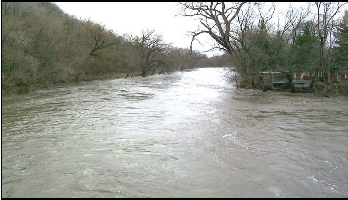
Table 1.CN. Cannon River Monitoring Station Information

Station Address: 14951 264th Street Path, Welch, MN 55089 County: Goodhue Major Basin: Mississippi River Basin Watershed: Cannon River Drainage Area: 1,340 square miles