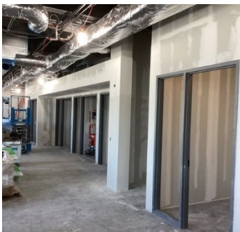
Area A – Level 1 offices

Area E—Guard Station pile driving is complete and underground utilities are being installed.