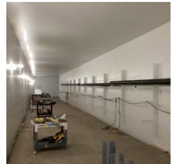
Area D – Tunnel