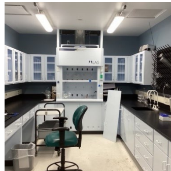
Area B – Laboratory area