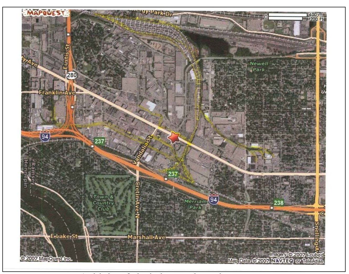
Aerial view of what is shown on the previous map. Minnesota Transfer properties are marked in yellow.