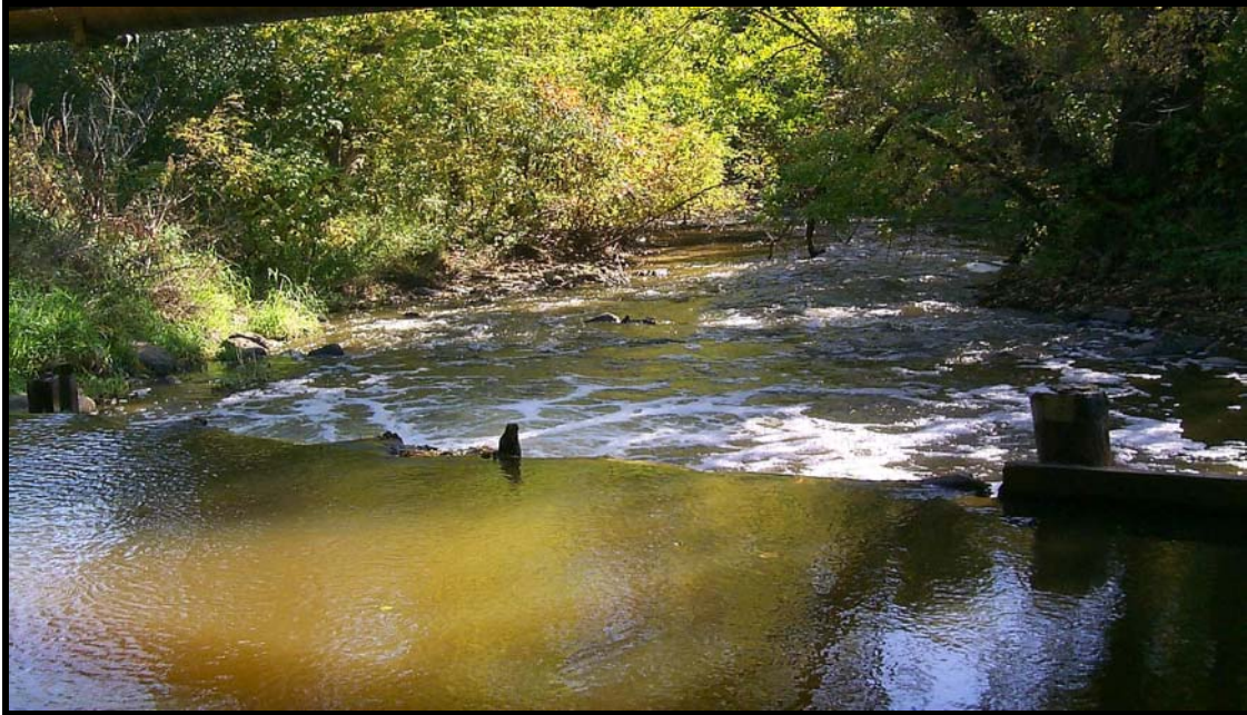
Table 1.CA. Carver Creek Monitoring Station Information

Station Address: 14025 1/2 Carver County Road 40, Carver, MN County: Carver Major Basin: Minnesota River Basin Watershed: Carver Creek Drainage Area: 83.5 square miles