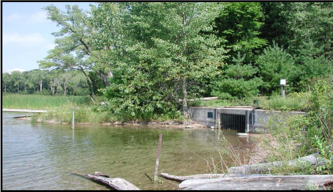
Table 1.CM. Carnelian-Marine Outlet Monitoring Station Information

Station Address: Little Carnelian Lake Outlet near Partridge Road, Stillwater, MN County: Washington Major Basin: St. Croix River Basin Watershed: Carnelian Marine Watershed Drainage Area: 30.05 square miles