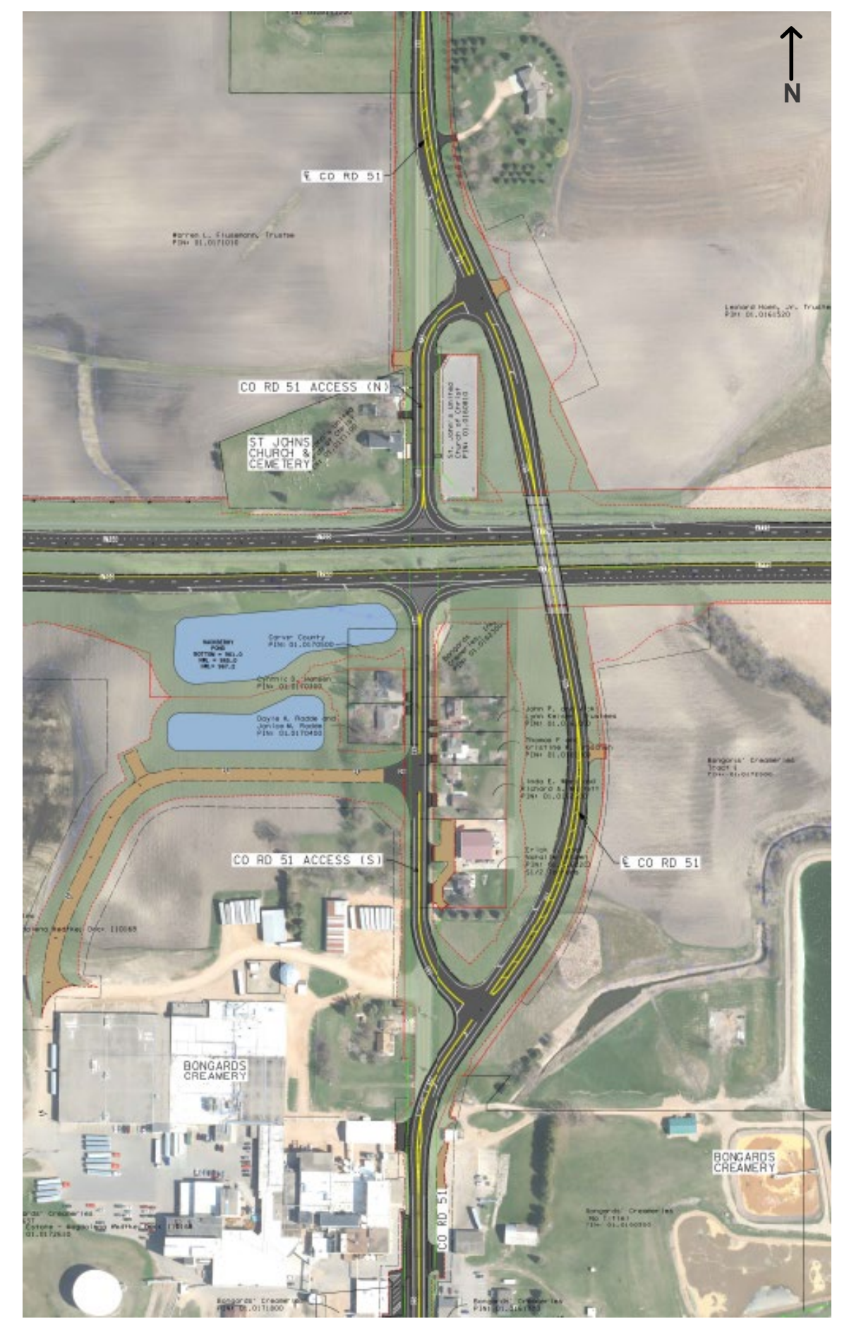
Figure 2: Project Layout