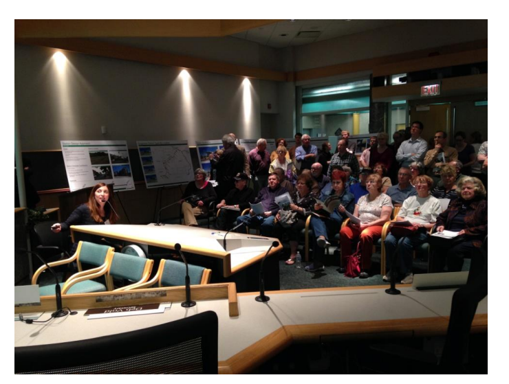
April 14 Hopkins/Minnetonka Open House