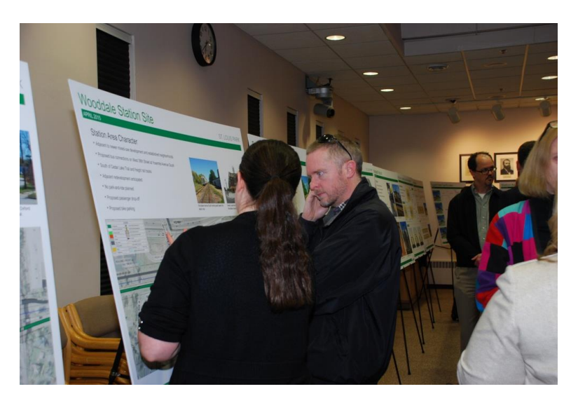
April 8 St. Louis Park Open House