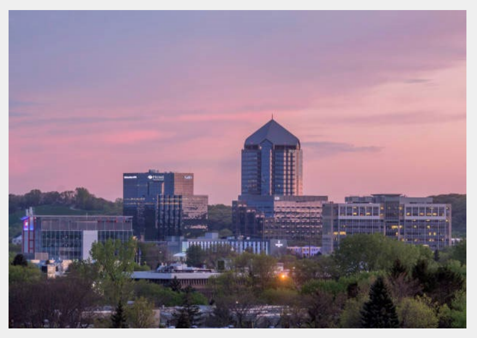
A view of Bloomington, Minnesota