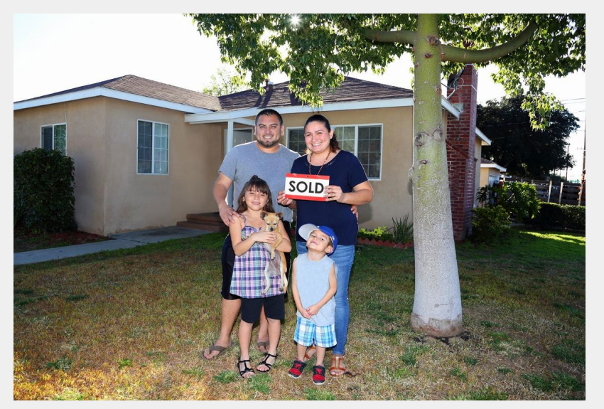
A new start for a new family