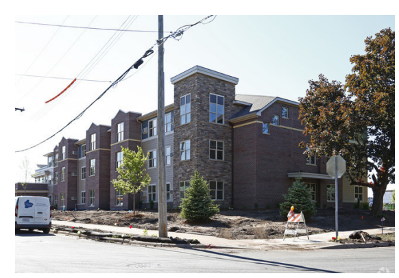
After photo from a different vantage point